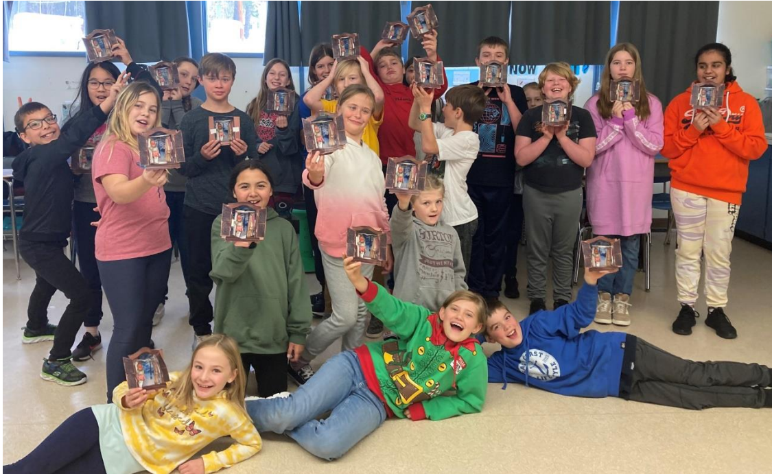
Grade 5-6 have been doing some study of C.S. Lewis' classic story: The Lion, The Witch, and the Wardrobe. So . . . they made the wardrobe.