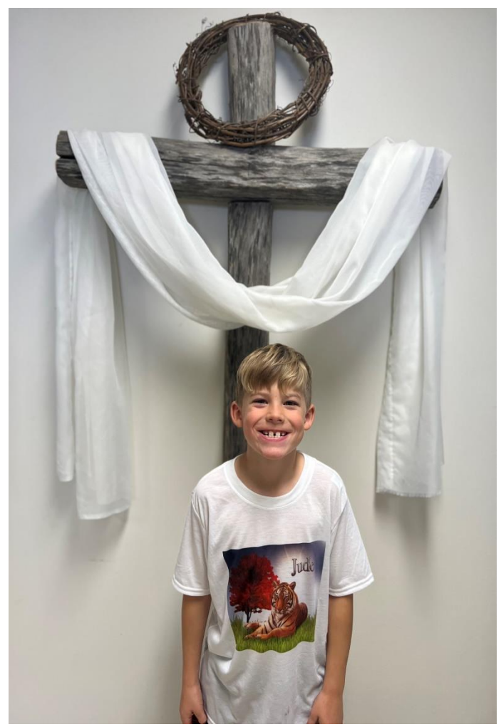
Remembrance Day Art