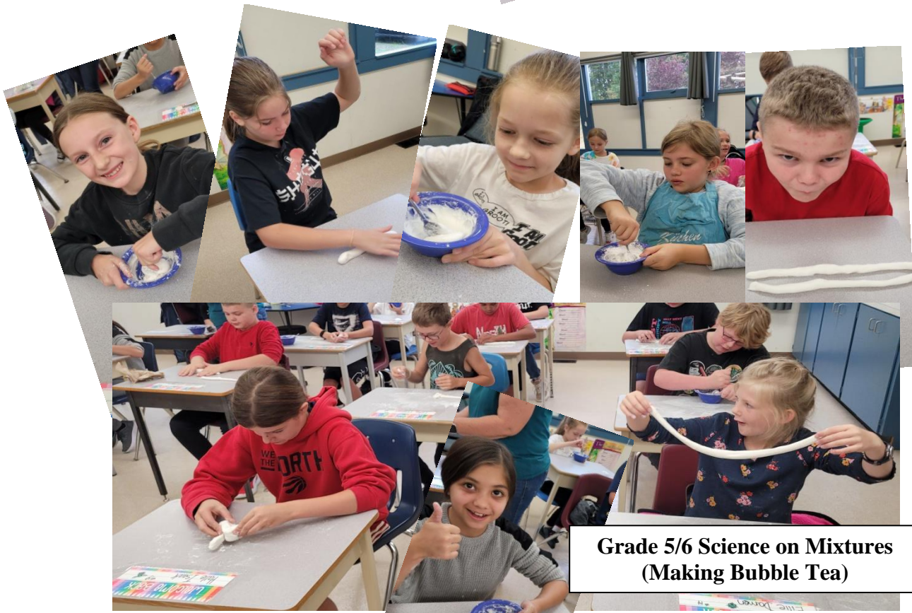
Grade 5/6 Science on Mixtures (Making Bubble Tea)