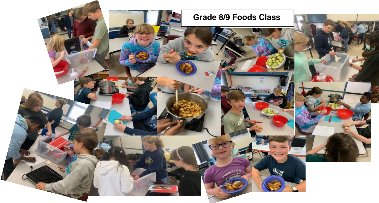
Grade 8/9 Foods Class